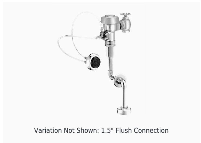
Variation Not Shown: 1.5" Flush Connection